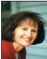
M.Mgt. M.Ed.ST. B.A. Grad.Dip.Lib